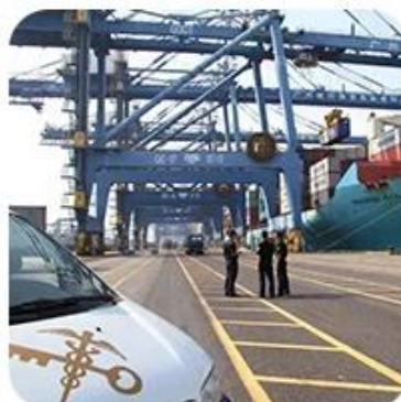
8) Import Customs Clearance