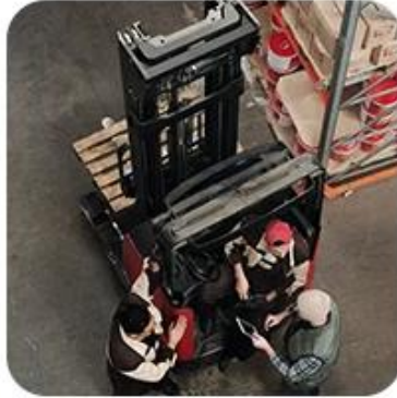
2) Pick-Up Cargo from 1 or Mutli Factory