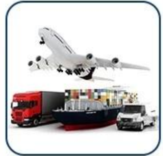
4) International Shipping