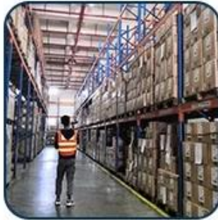
2) HMD Logistics Warehouse