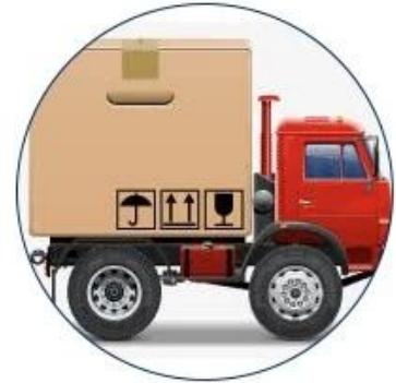
6. Start shipping