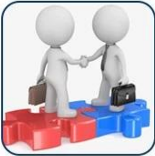
1) China Supplier