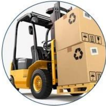
7. Unpacking container