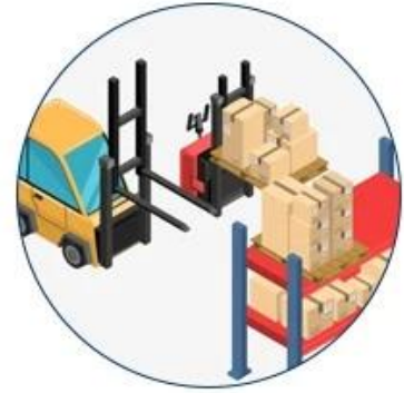
3. Deliver to warehouse