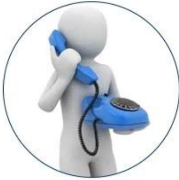
1. Discuss shipment