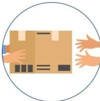
11. Arrive destination