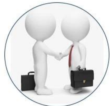
12. Follow up