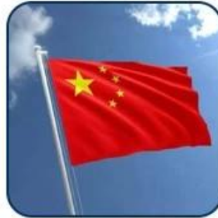
3) China Exporting