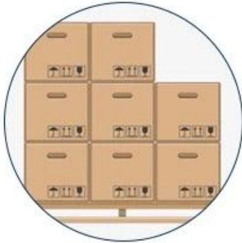
4. Palletising and labeling