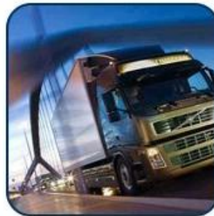
6) Truck Delivery