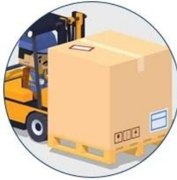
2. Pick up from origin