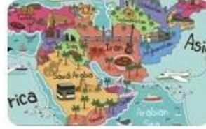
the Middle East