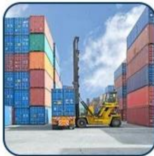
5) Destination Importing