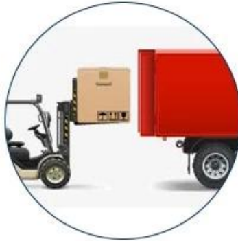
5. Pack into container