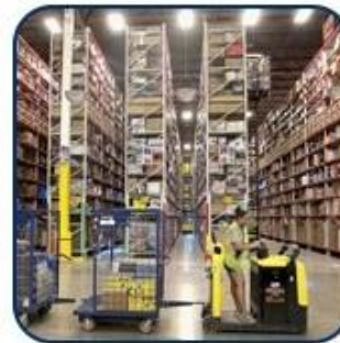
7) Amazon FBA Warehouse