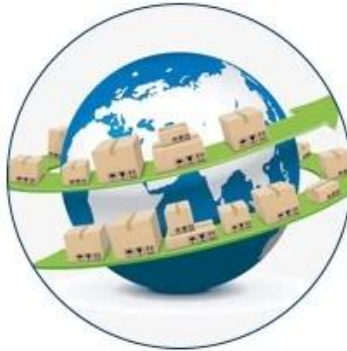
8. Import clearance