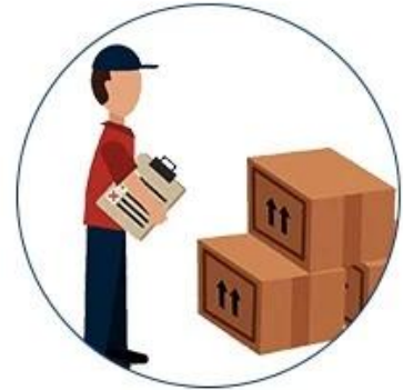
9. Ready for collection