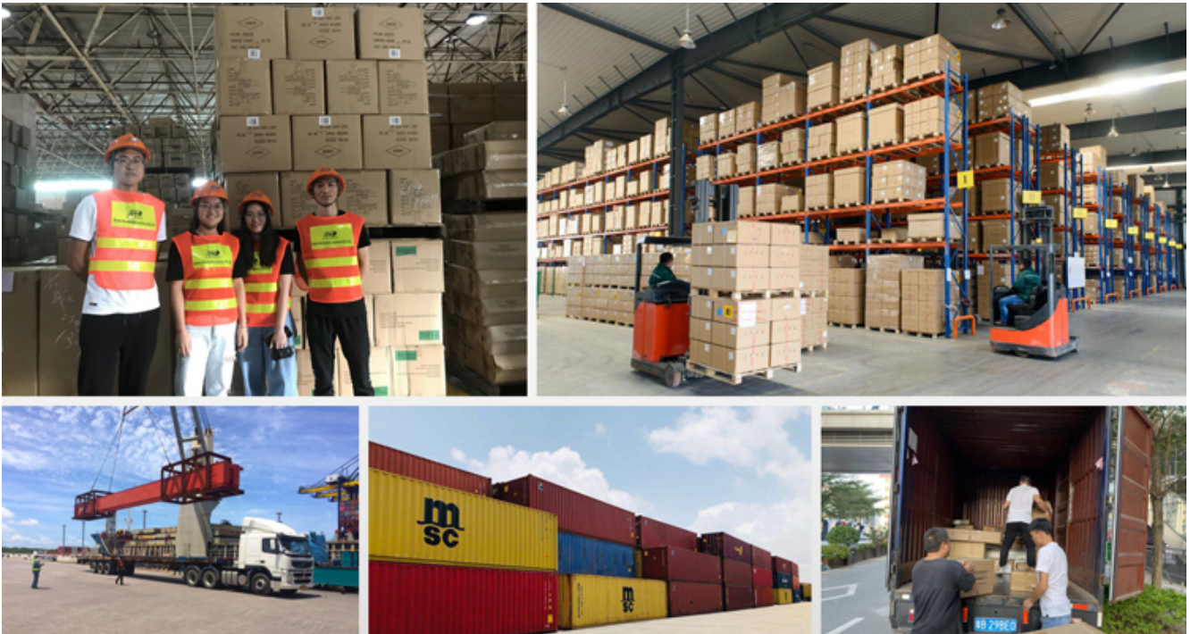
Photo Cargo Display

Warm Tips: shipping time above is just for your information.