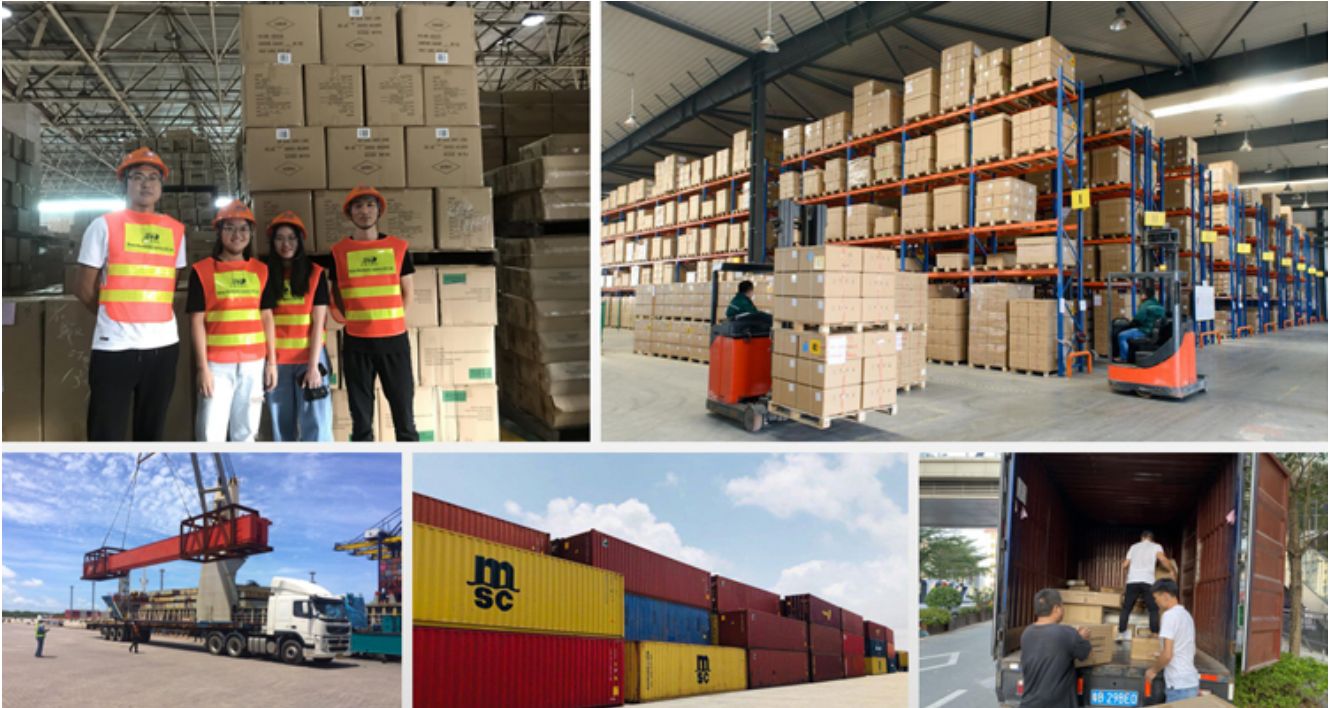
Photo Cargo Display

Warm Tips: shipping time above is just for your information.