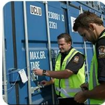
5) Export Customs Clearance