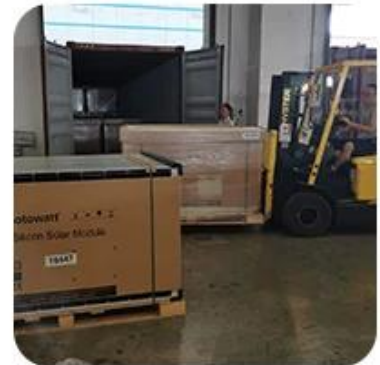
6) Loading to Container