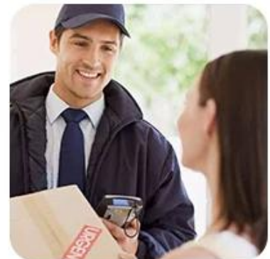
9) Delivery to Door