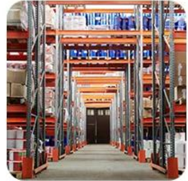
3) Delivery to Warehouse