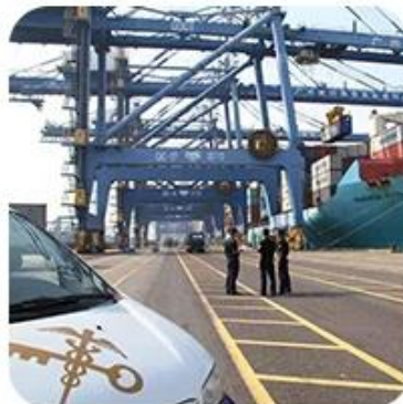
8) Import Customs Clearance