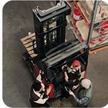
2) Pick-Up Cargo from 1 or Mutli Factory