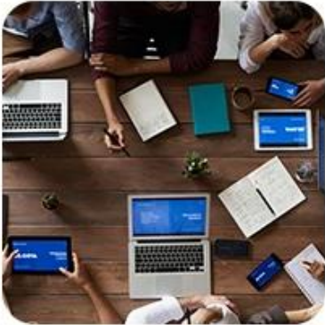
1) Offer Shipping Schedule