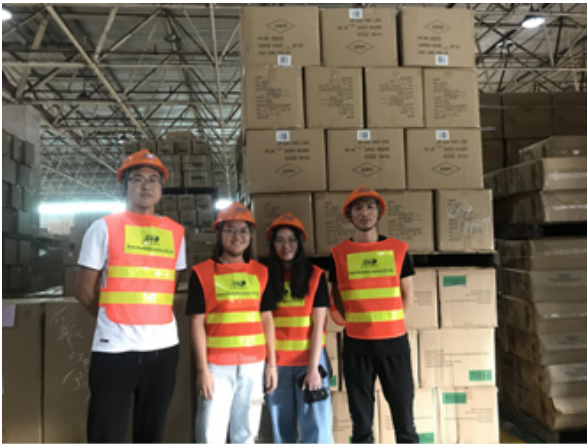
Photo Cargo Display

Warm Tips: shipping time above is just for your information.