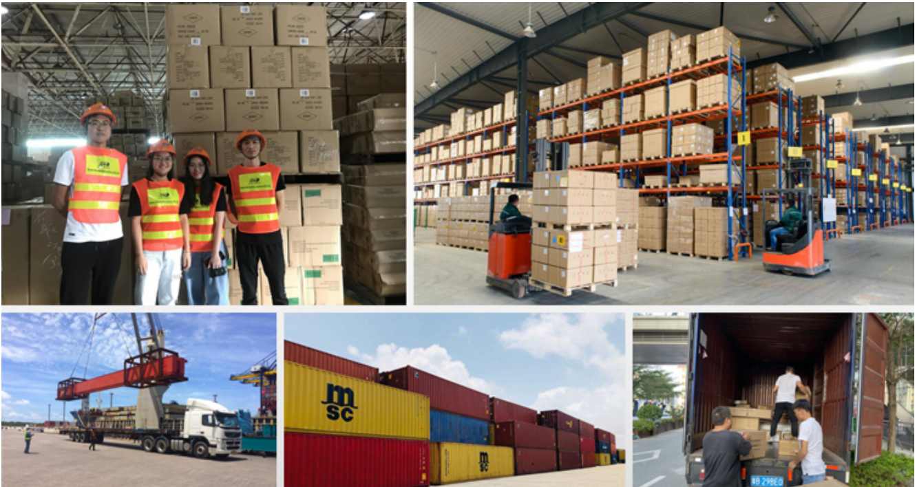
Photo Cargo Display

Warm Tips: shipping time above is just for your information.