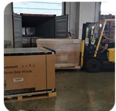
6) Loading to Container