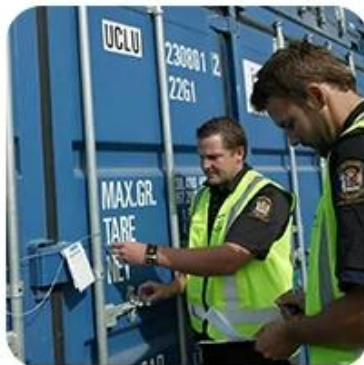
5) Export Customs Clearance