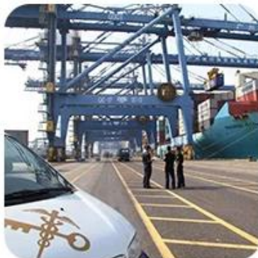
8) Import Customs Clearance