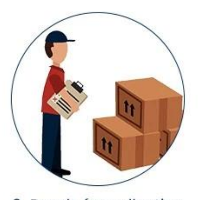
9. Ready for collection