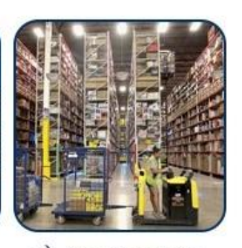
7) Amazon FBA Warehouse