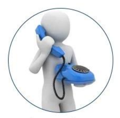
1. Discuss shipment