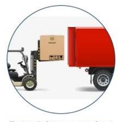
5. Pack into container