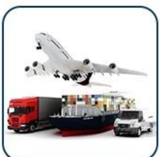
4) International Shipping