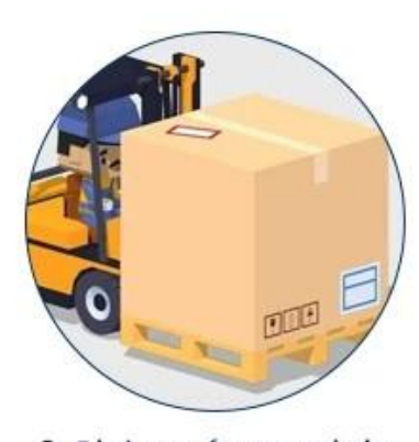
2. Pick up from origin