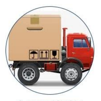
6. Start shipping