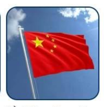
3) China Exporting