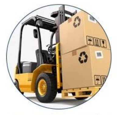
7. Unpacking container