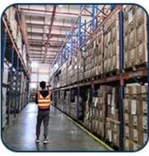
2) HMD Logistics Warehouse