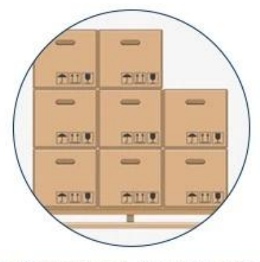
4. Palletising and labeling