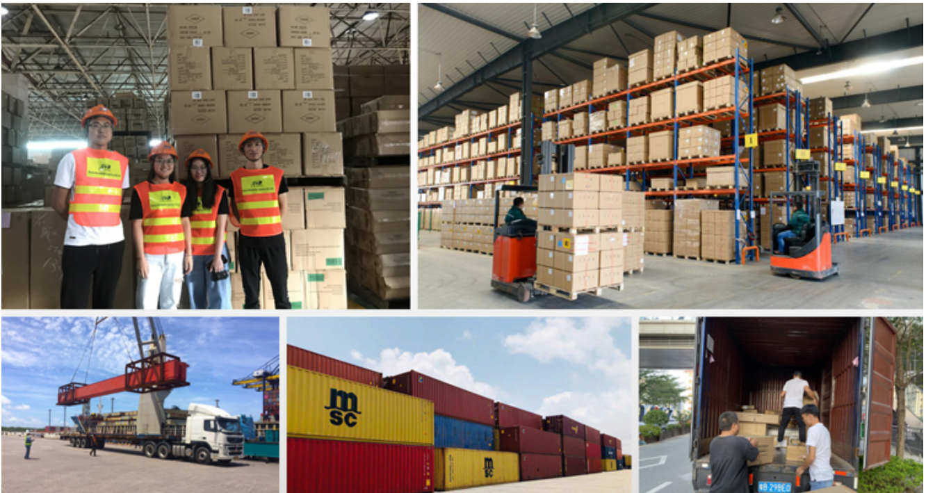
Photo Cargo Display

Warm Tips: shipping time above is just for your information.