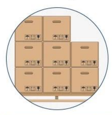
4. Palletising and labeling