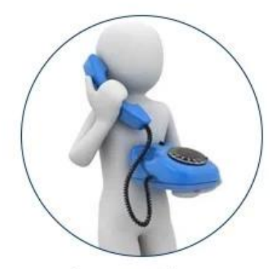
1. Discuss shipment