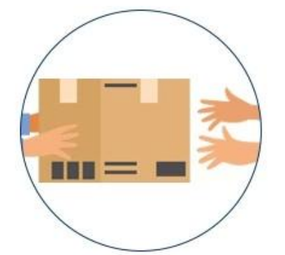
11. Arrive destination