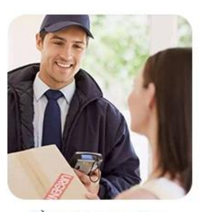
9) Delivery to Door