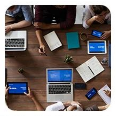
1) Offer Shipping Schedule