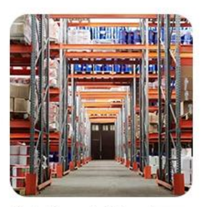
3) Delivery to Warehouse