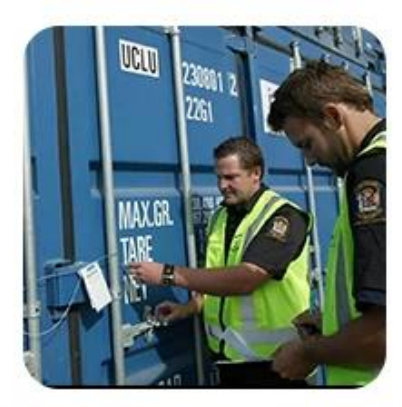
5) Export Customs Clearance