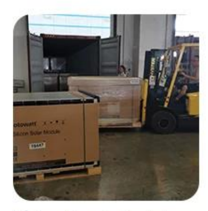
6) Loading to Container