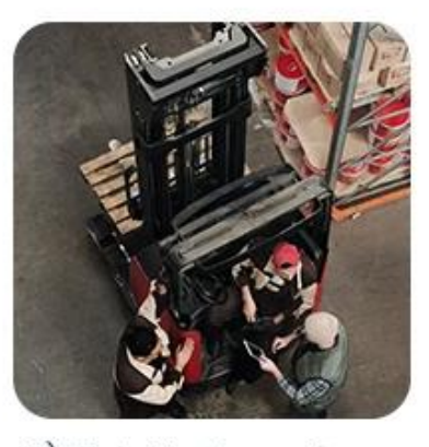
2) Pick-Up Cargo from 1 or Mutli Factory