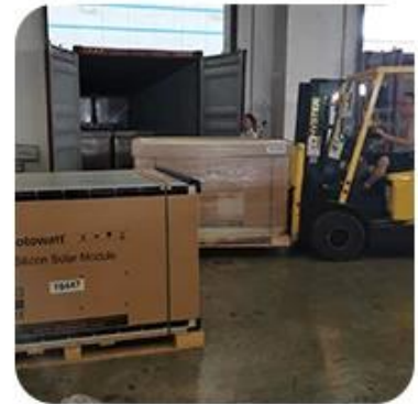
6) Loading to Container