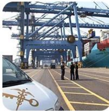
8) Import Customs Clearance