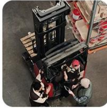
2) Pick-Up Cargo from 1 or Mutli Factory