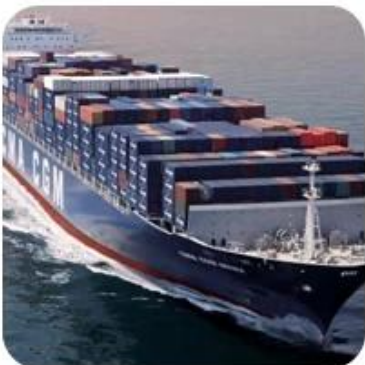
7) Shipping to Destination