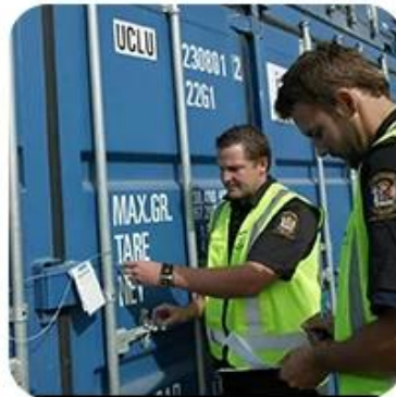
5) Export Customs Clearance