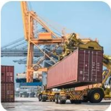
4) Loading on Boat