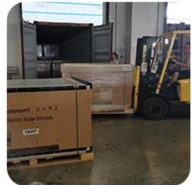
6) Loading to Container