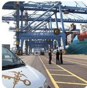
8) Import Customs Clearance