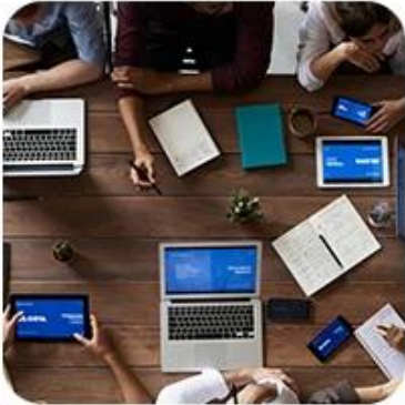
1) Offer Shipping Schedule