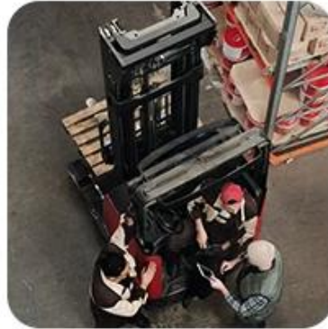
2) Pick-Up Cargo from 1 or Mutli Factory