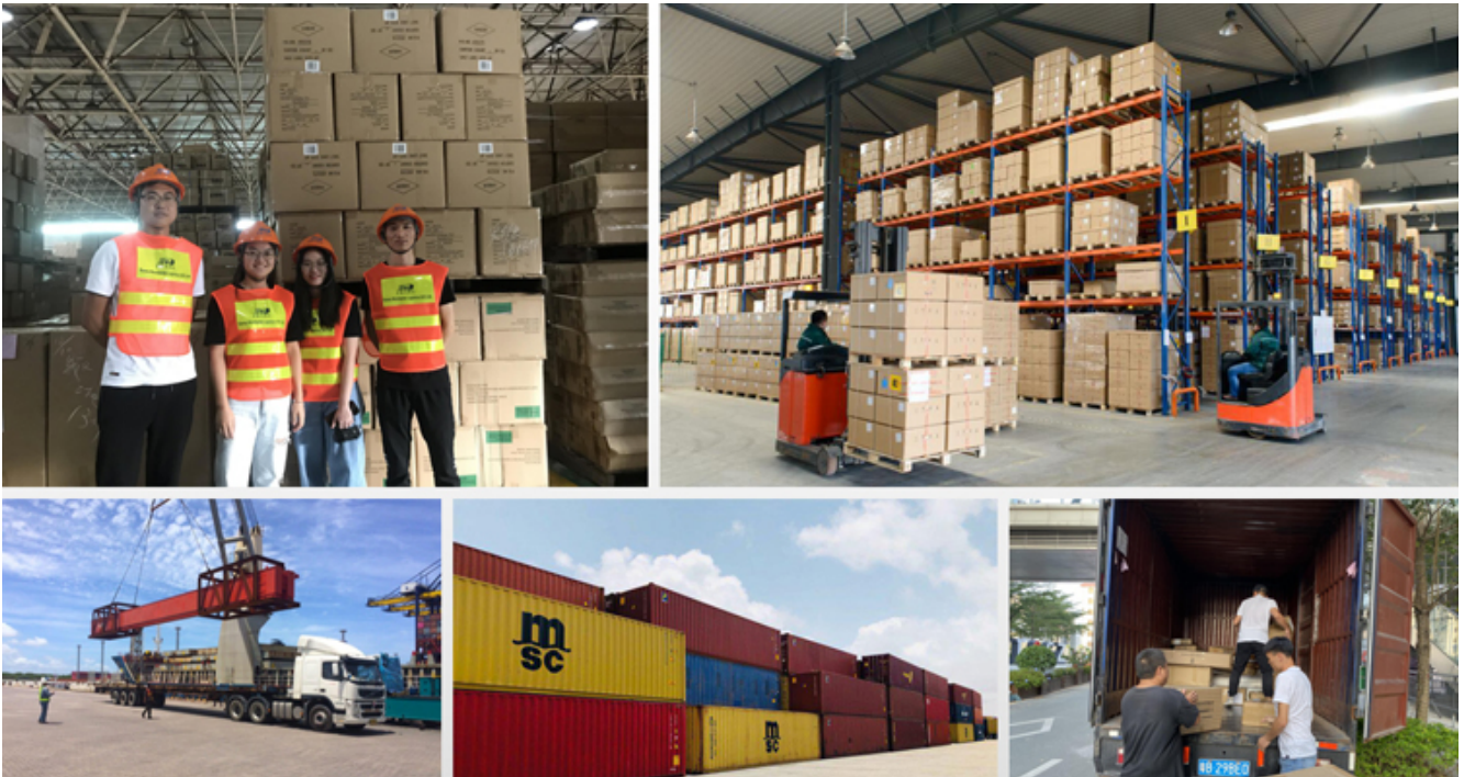
Photo Cargo Display

Warm Tips: shipping time above is just for your information.