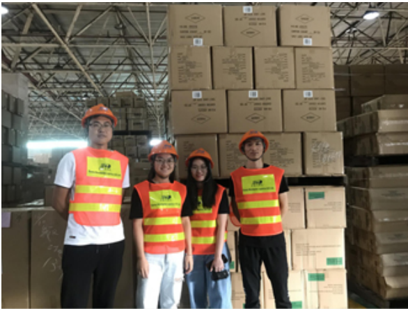
Photo Cargo Display

Warm Tips: shipping time above is just for your information.