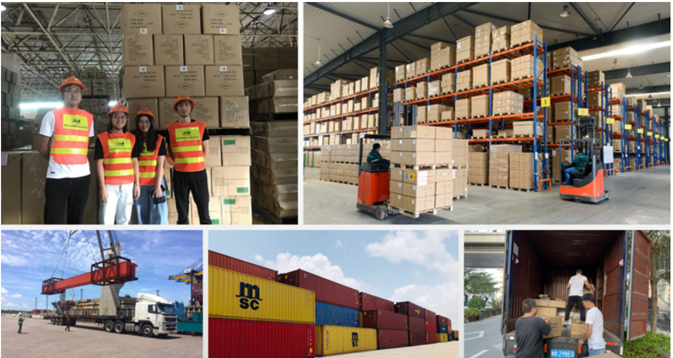
Photo Cargo Display

Warm Tips: shipping time above is just for your information.