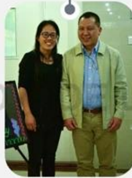
Sunny Worldwide Logistics