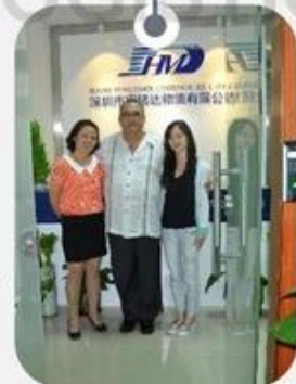
Group photo with client