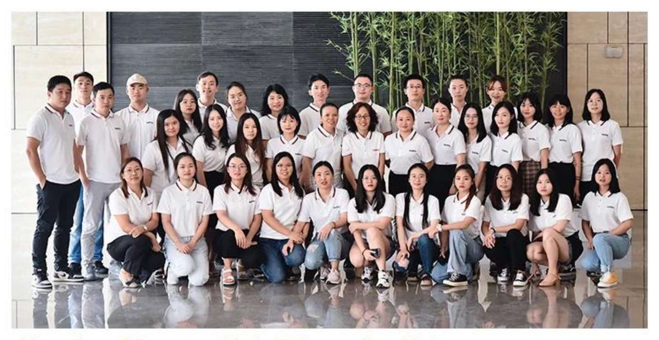
More than 20 years of freight forwarding history, and over half of staffs working in Sunny about 5-13years.