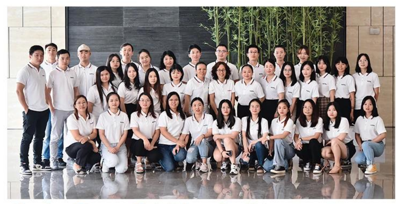
More than 20 years of freight forwarding history, and over half of staffs working in Sunny about 5-13years.