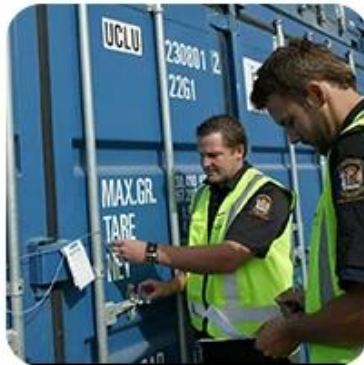
5) Export Customs Clearance