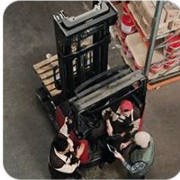
2) Pick-Up Cargo from 1 or Mutli Factory