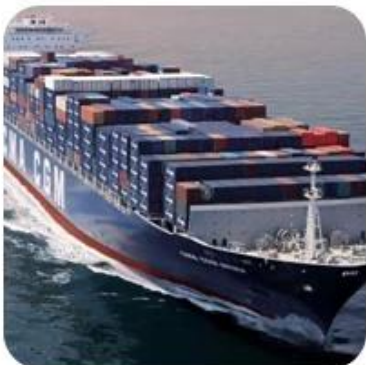
7) Shipping to Destination