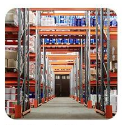
3) Delivery to Warehouse