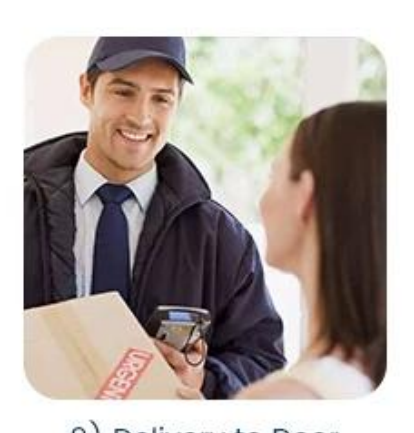
9) Delivery to Door