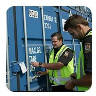
5) Export Customs Clearance