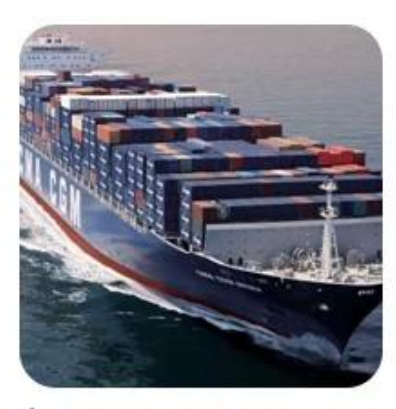
7) Shipping to Destination 8) Import Customs Clearance