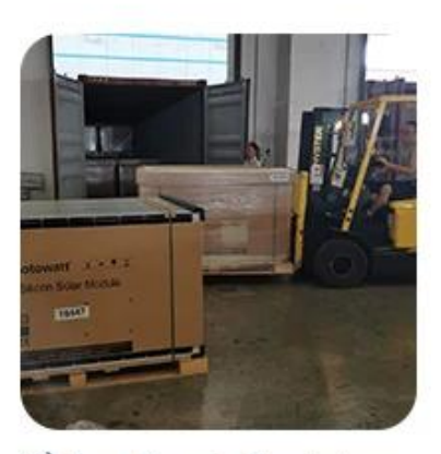
6) Loading to Container