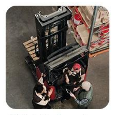
2) Pick-Up Cargo from 1 or Mutli Factory