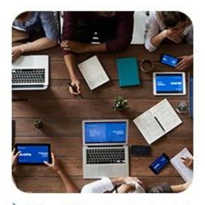
1) Offer Shipping Schedule